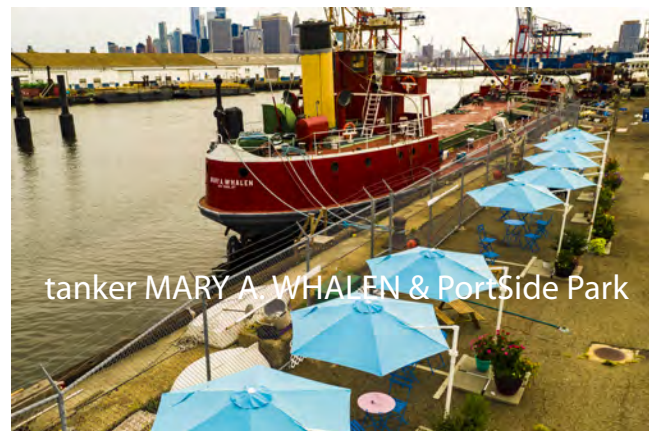
tanker MARY A. WHALEN & PortSide Park