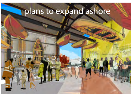
plans to expand ashore

We advocate for growing sustainable maritime uses of NYC's archipelago with its 520 miles of coast, ports, and waterways: BLUEspace assets for work, freight, education, culture, and recreation.